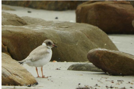
Hoodie chick seen at September Beach