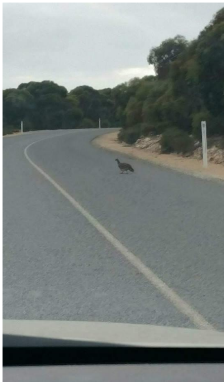
DEW fire crew photo of most recent Malleefowl sighting